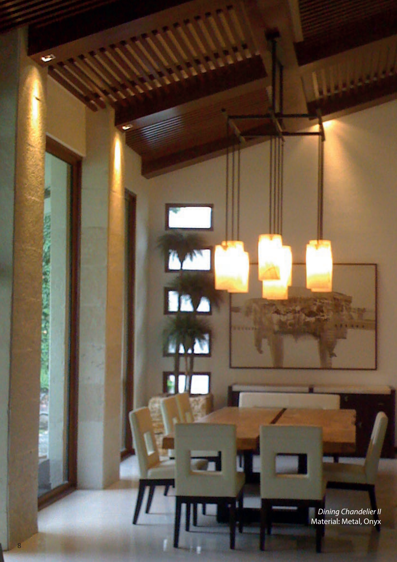
Dining Chandelier II Material: Metal, Onyx