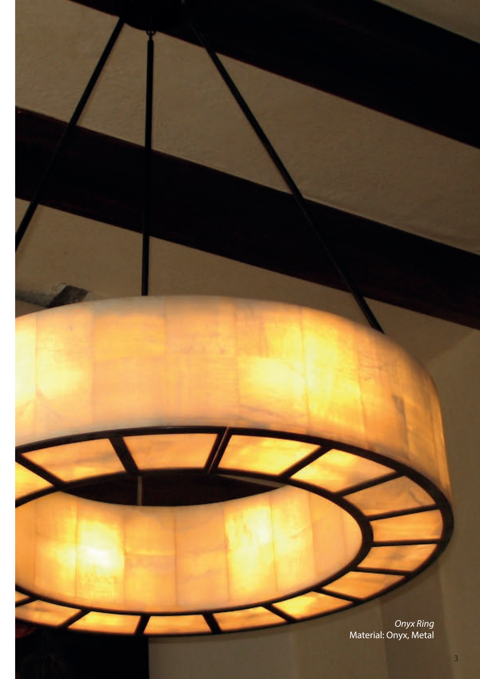
Onyx Ring Material: Onyx, Metal