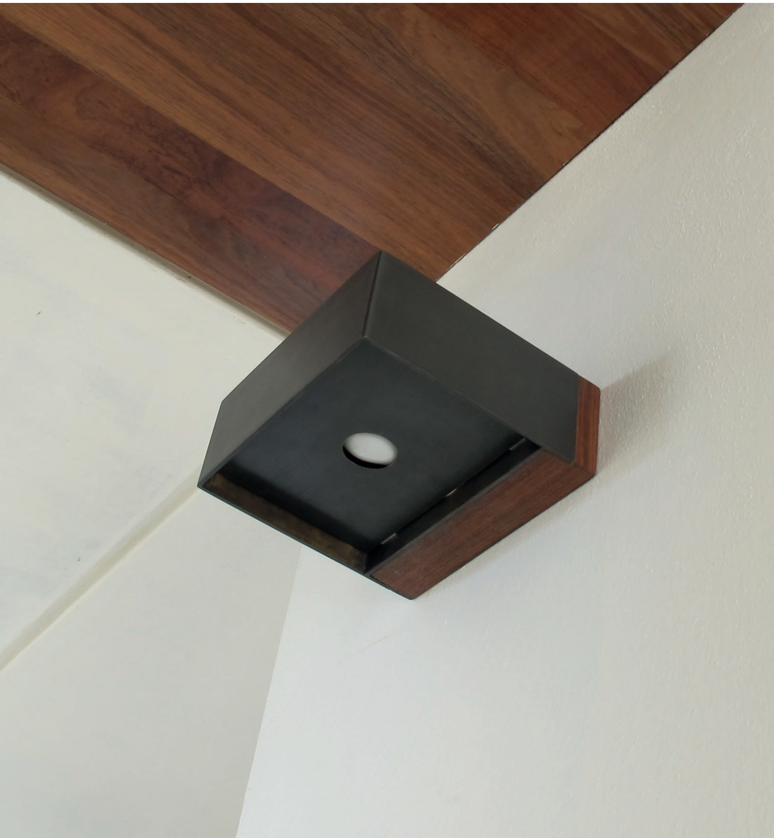
Wall Square Lamp