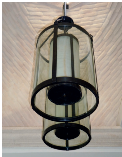
Small Cilinder Material: Metal, Onyx, Glass