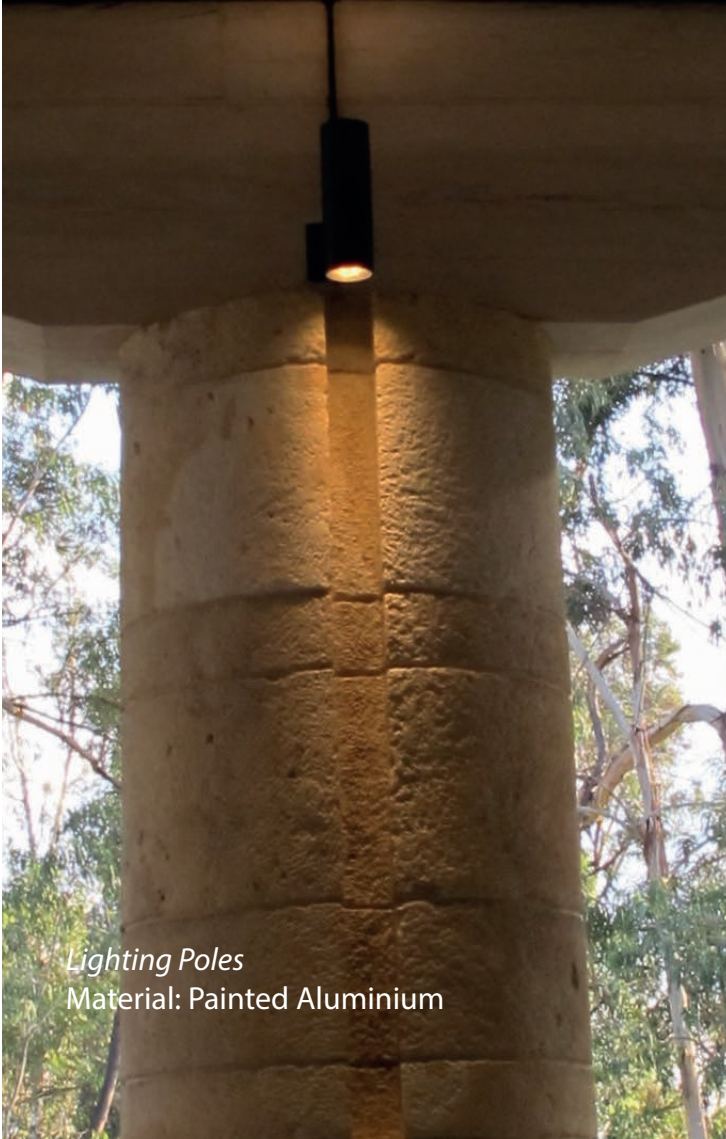
Lighting Poles Material: Painted Aluminium