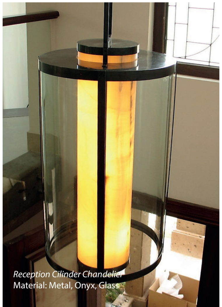
Reception Cilinder Chandelier Material: Metal, Onyx, Glass