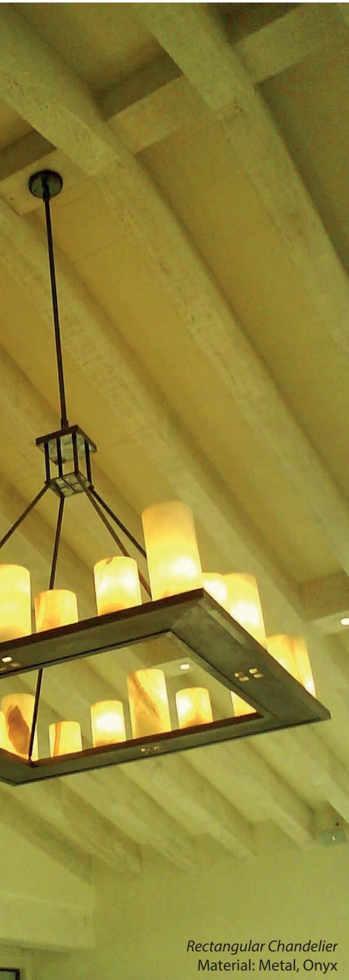
Rectangular Chandelier Material: Metal, Onyx