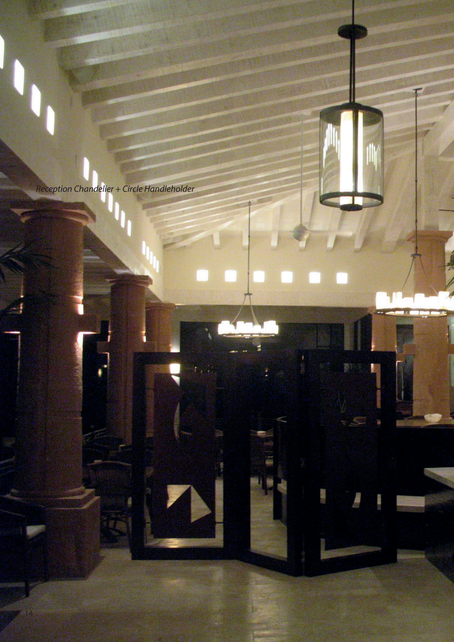
Reception Chandelier + Circle Handleholder