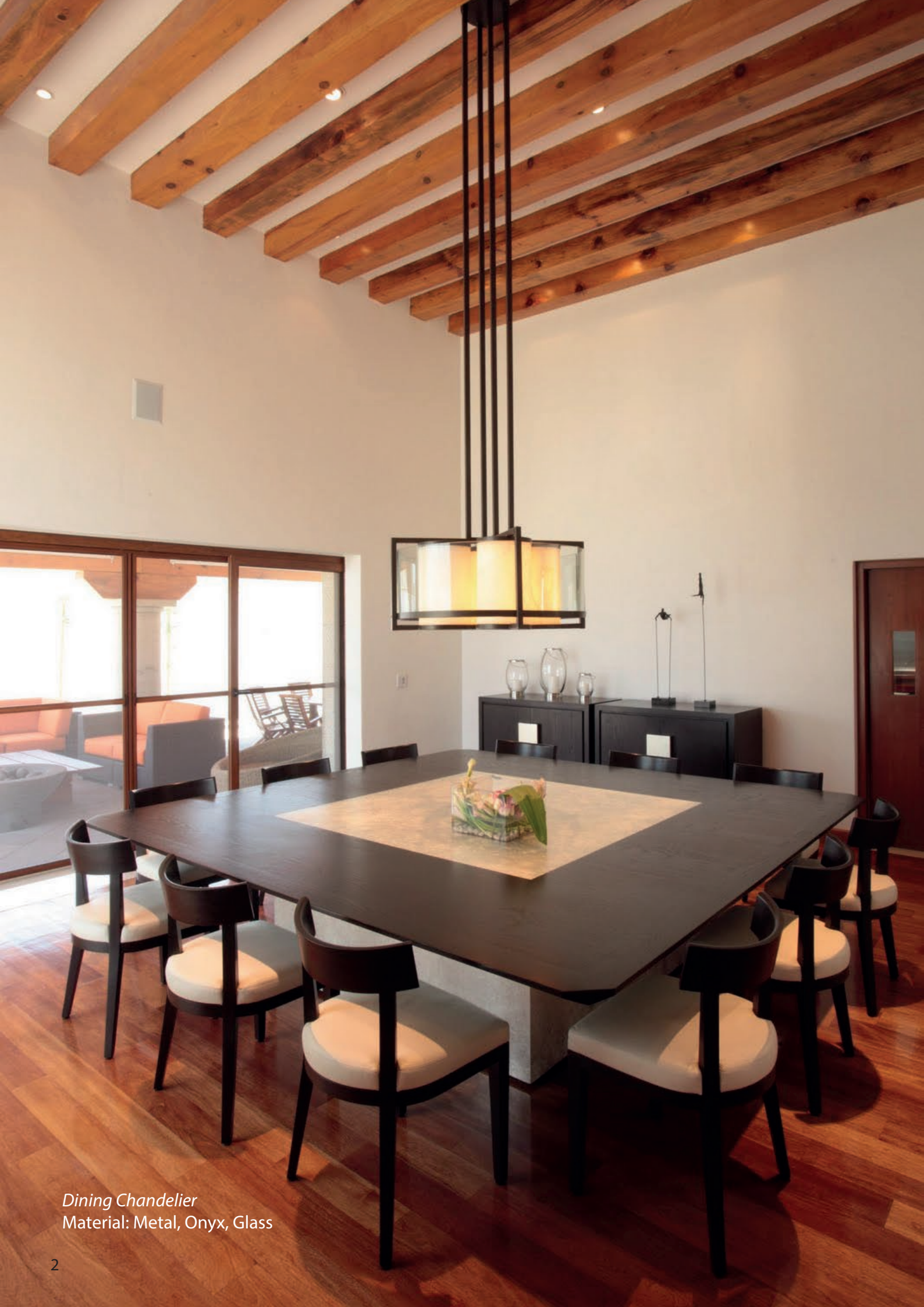
Dining Chandelier Material: Metal, Onyx, Glass