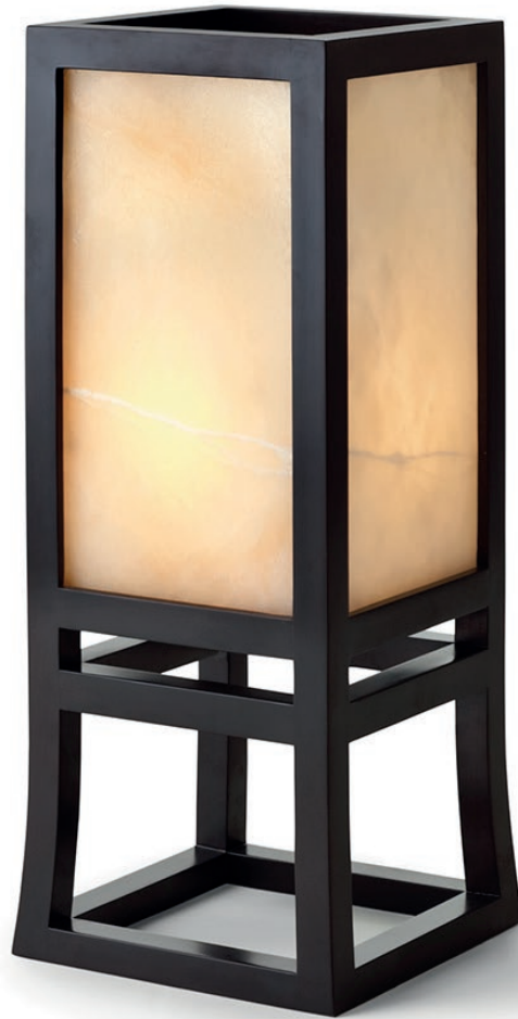
Table Cont. Lamp Material: Metal and Onyx