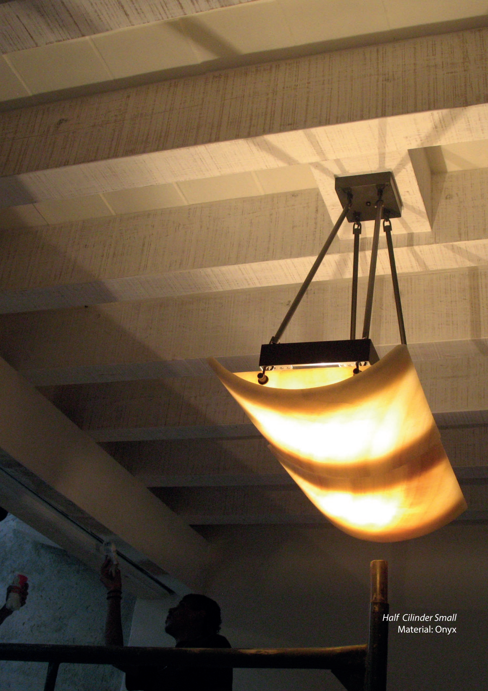
Half Cilinder Small Material: Onyx