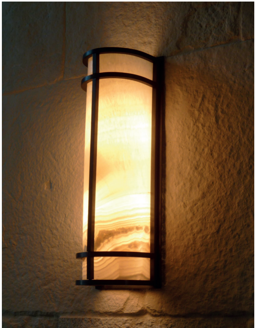
Wall Long Lamp Material: Metal, Onyx

This eclectic style rescues Colonial aspects of design as it features materials like onyx, stone, glass and vintage looking metals.