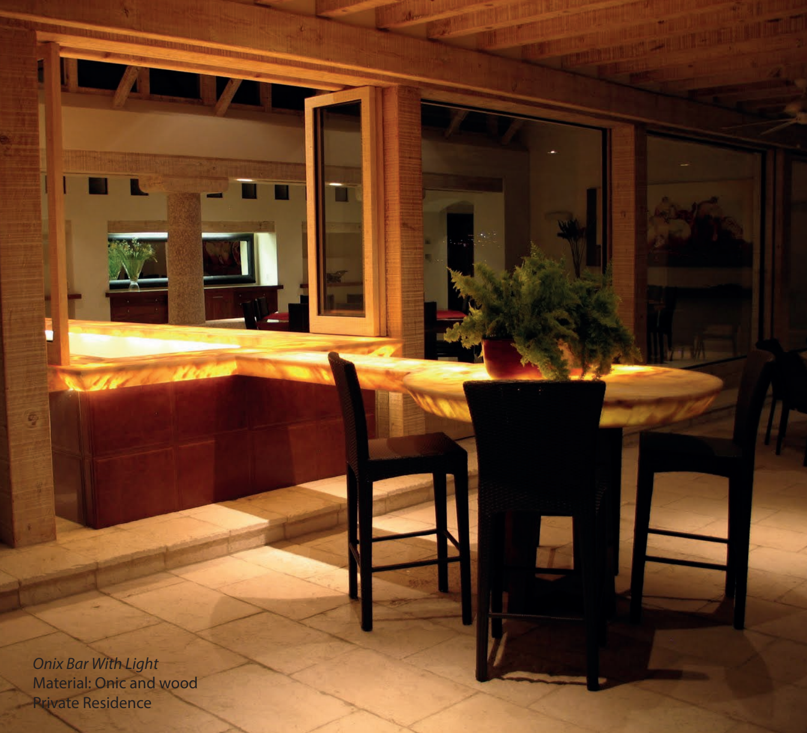
Onix Bar With Light Material: Onix and wood Private Residence