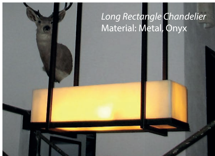
Long Rectangle Chandelier Material: Metal, Onyx