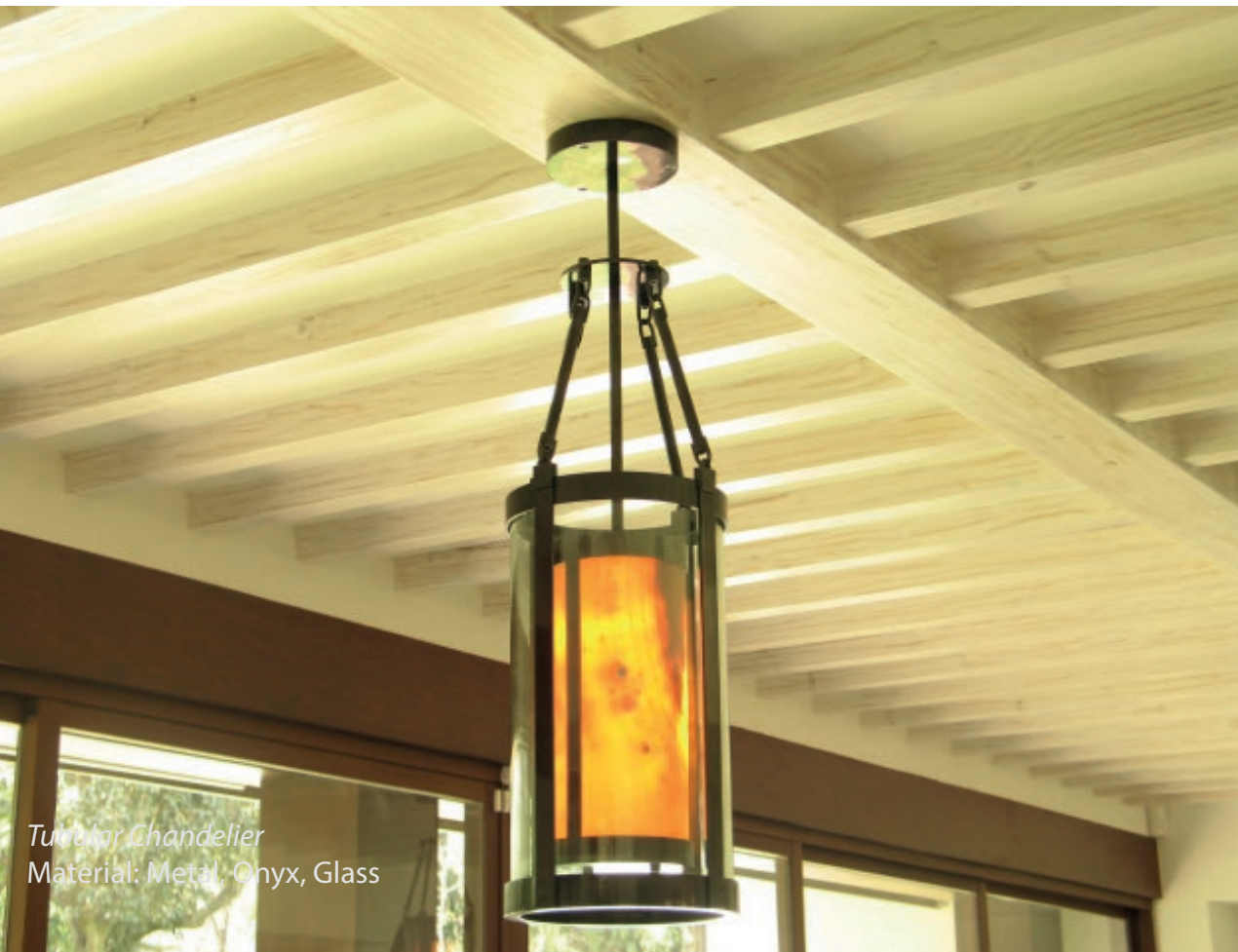
Turkey Chandelier Material: Metal, Onyx, Glass