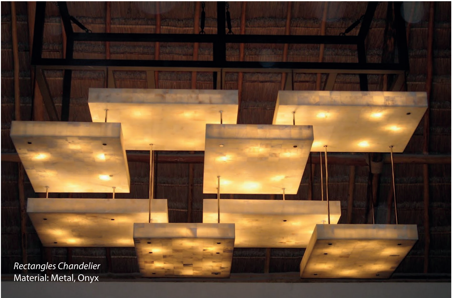
Rectangles Chandelier Material: Metal, Onyx