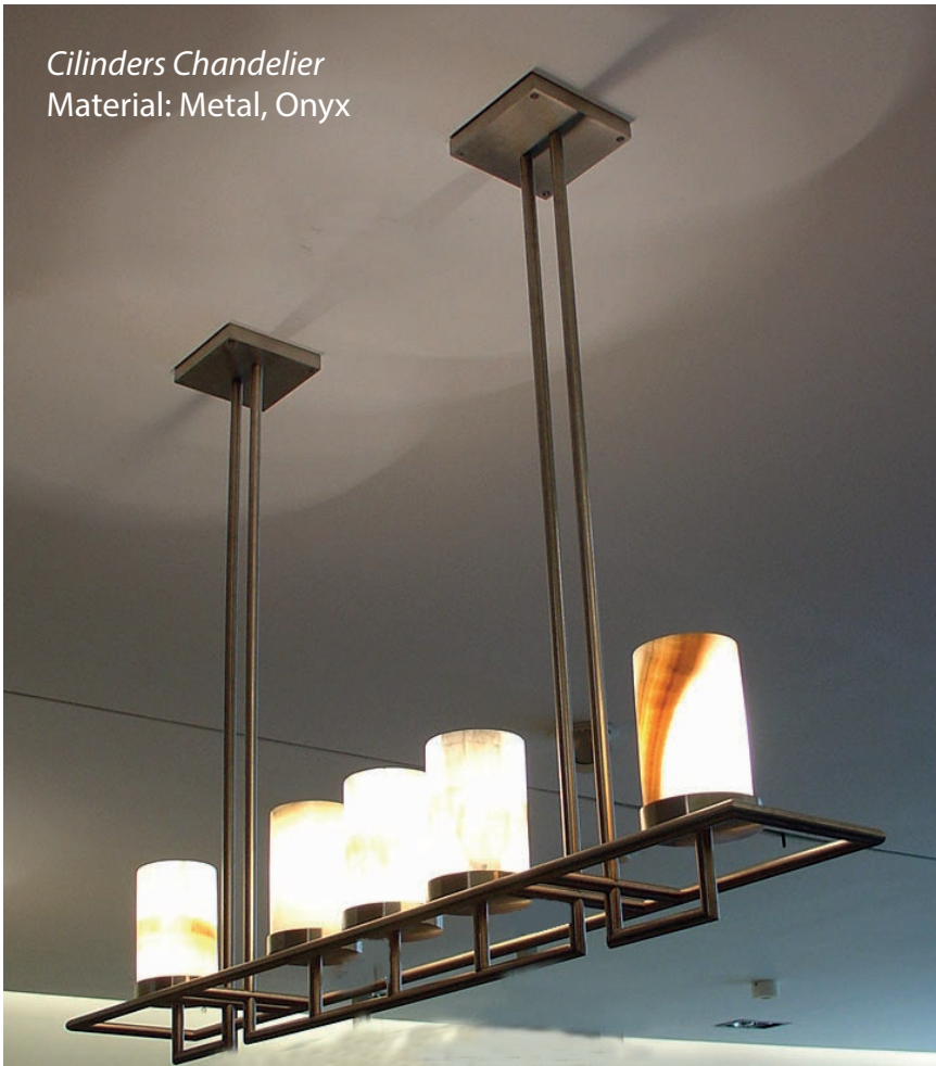
Cilinders Chandelier Material: Metal, Onyx